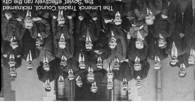
The Limerick Trades Council, nicknamed the 'Soviet' effectively ran the city.

The sights & story of Limerick's General Strike of 1919