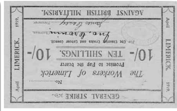
The soviet even printed its own money

Unfortunately, these events have largely been forgotten about – hidden away. Hopefully this walking tour, and the many other events being organized over the next weeks, can help make the people of Limerick aware of this chapter of our history, this forgotten revolution.