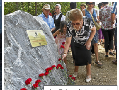
La Tejera (2010-09-4)